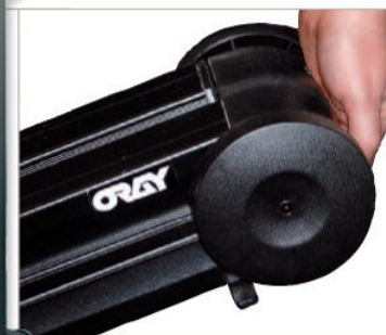
Wheels at the ends